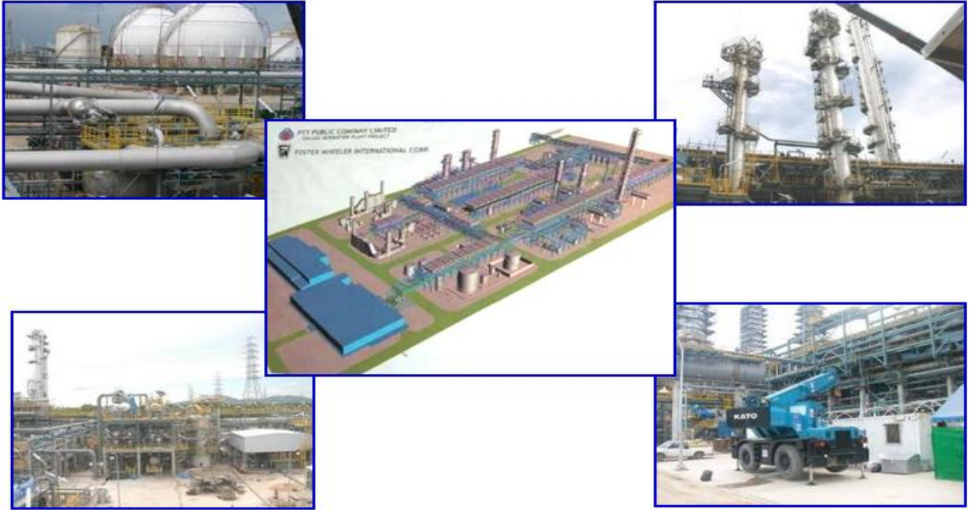
Above ground piping & Steel Structure Work (Expansion Project GSP5) Size : 300,000DB/ 3,000Tons