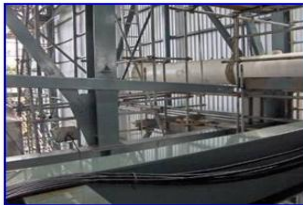
Steel Structure for On Shore Compressor