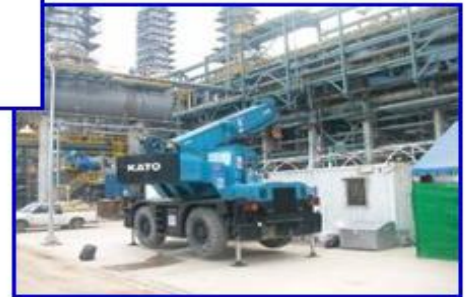
Above ground piping & Steel Structure Work (Expansion Project GSP5) Size : 300,000DB/ 3,000Tons