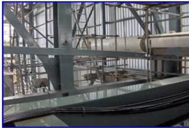
Weight Structure for On Shore Compressor