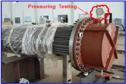
Upgrading of Heat Exchanger Testing