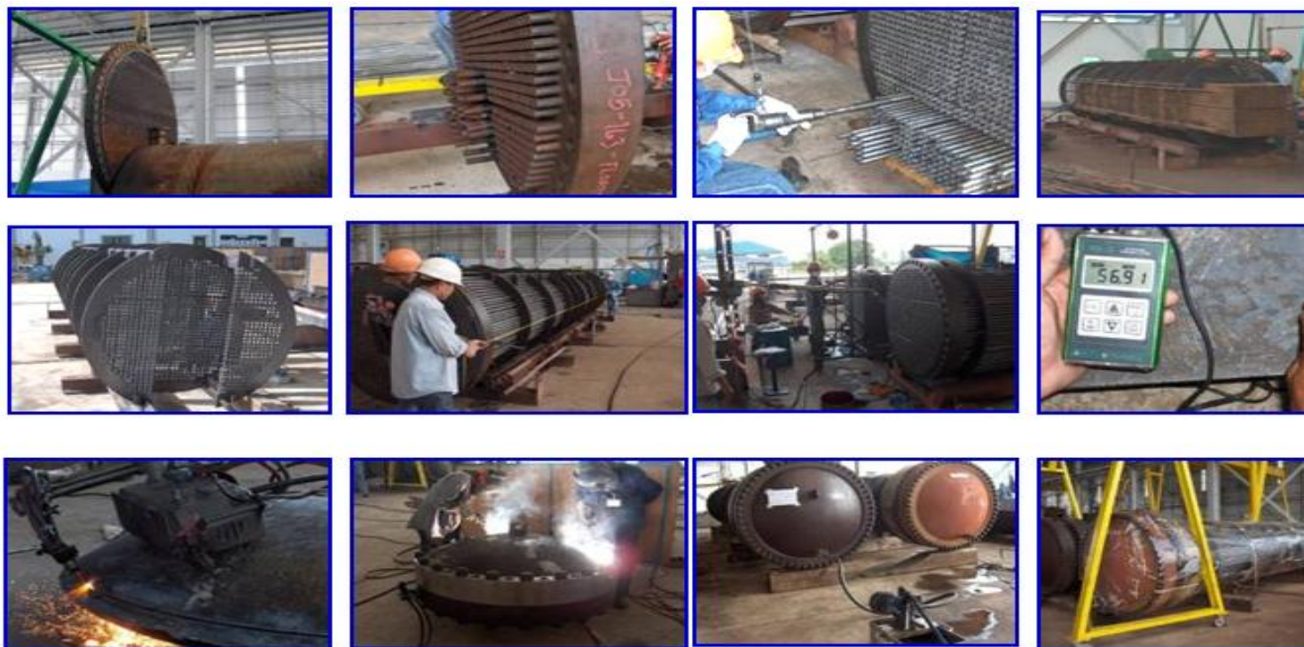
Size of 64-700 tubes 9:09546445 and Channel Head