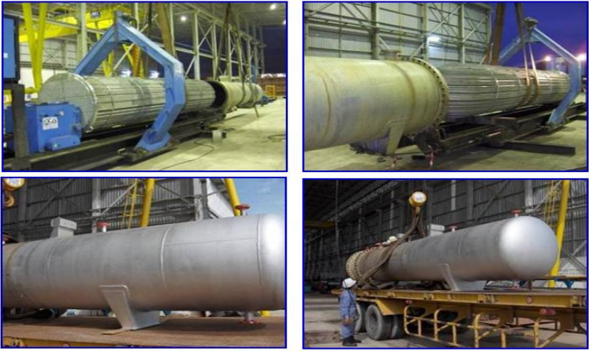
Special Designed Tube Bundle Insert