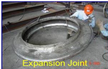
New Heat Exchanger Fabrication