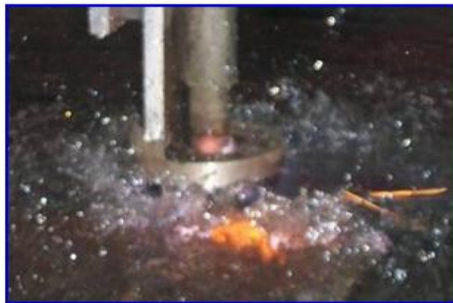
CNC Under Water Plasma Cutting