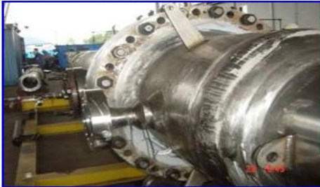
Fabrication of 2nd Stage Heater