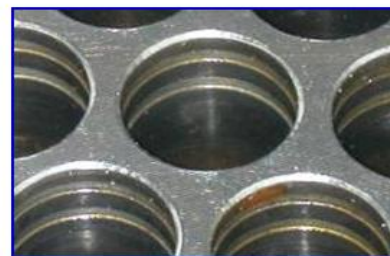
Tube Sheet Drilling by CNC