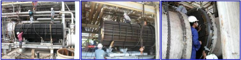
Size: ID 15,040mm x 24,000mm.